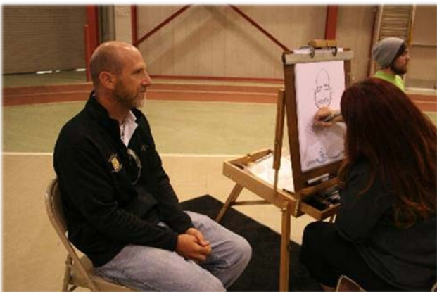
Caricature artists capture some new faces