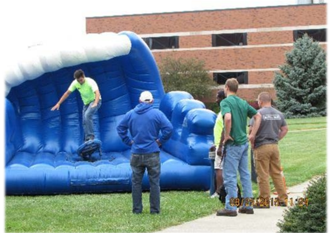
The HVAC students test their surfing skills

Make sure you check out Welcome Week activities in January for Spring Semester 2016!