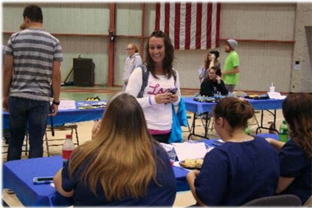
Students check out the Student Services and Involvement Fair